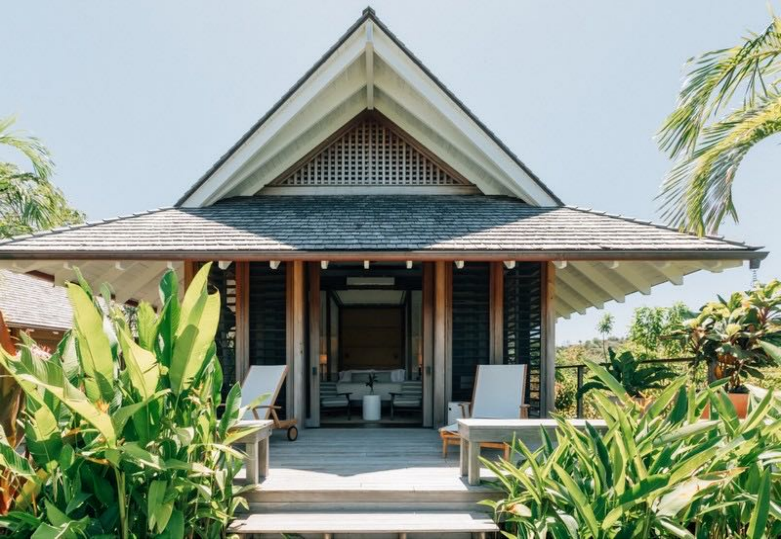
Islas Secas – Two-Bedroom Casita Tres Palmas