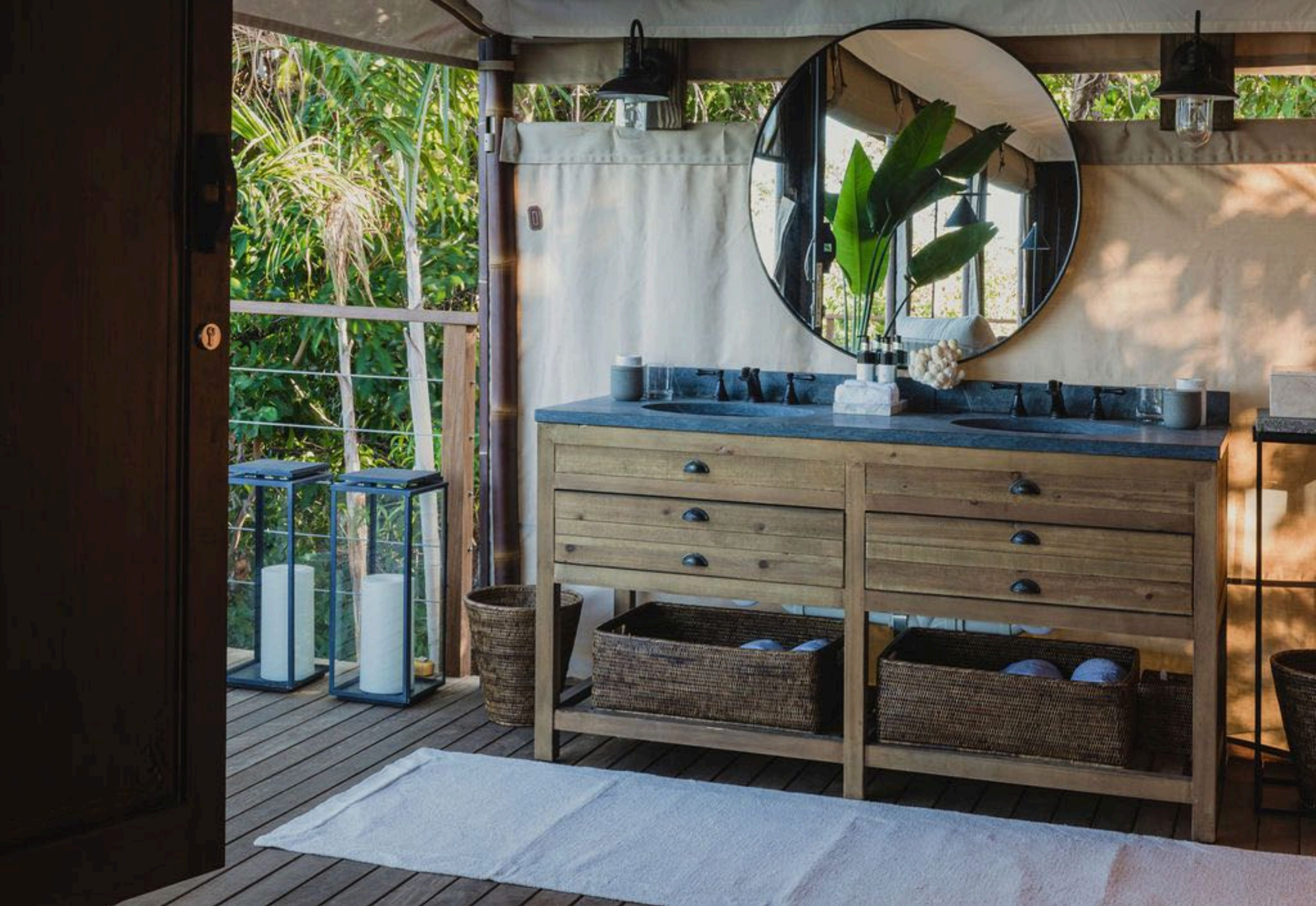
Islas Secas – One-Bedroom Tented Casita Bathroom