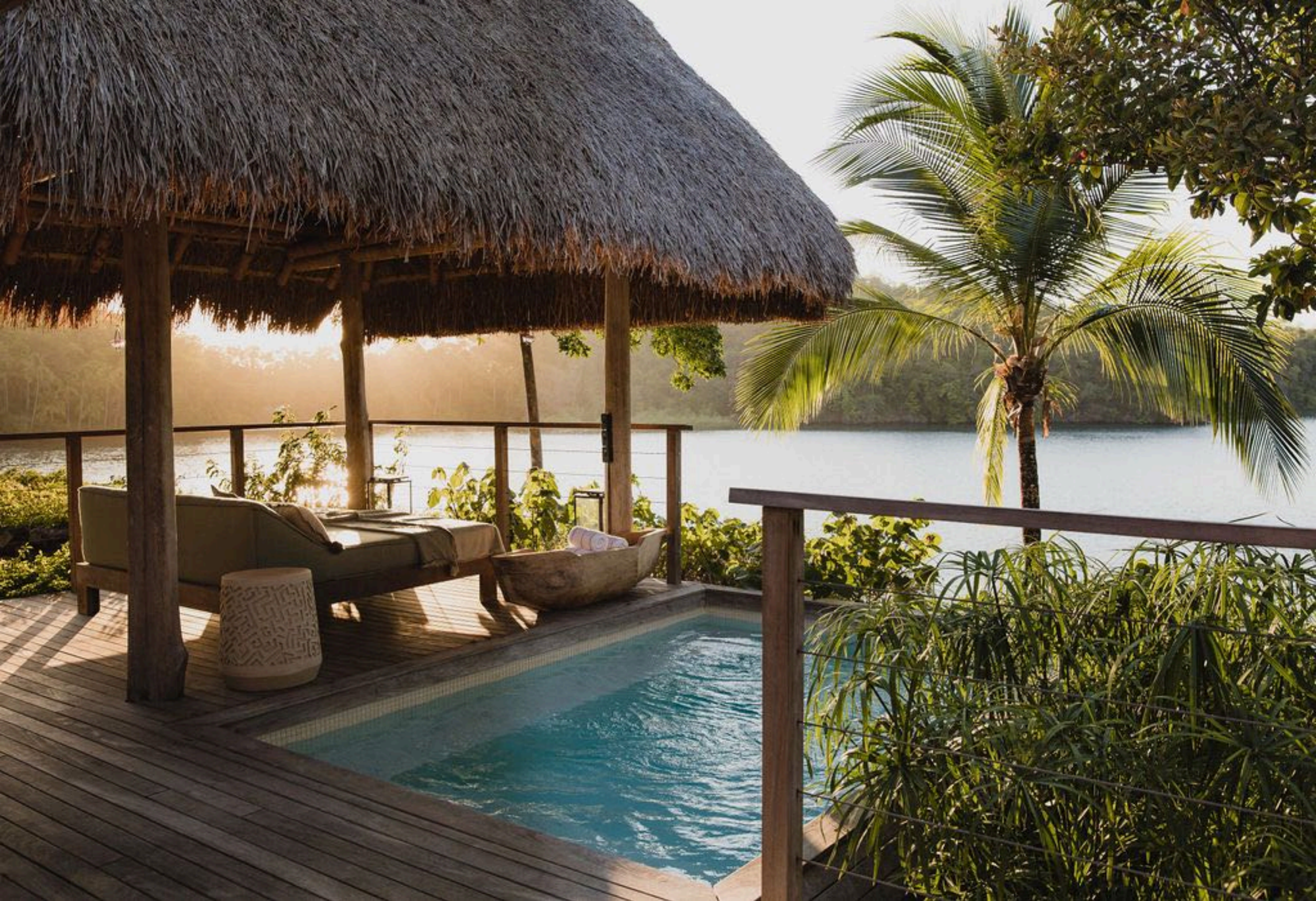
Islas Secas – Two-Bedroom Casita Tres Palmas plunge pool