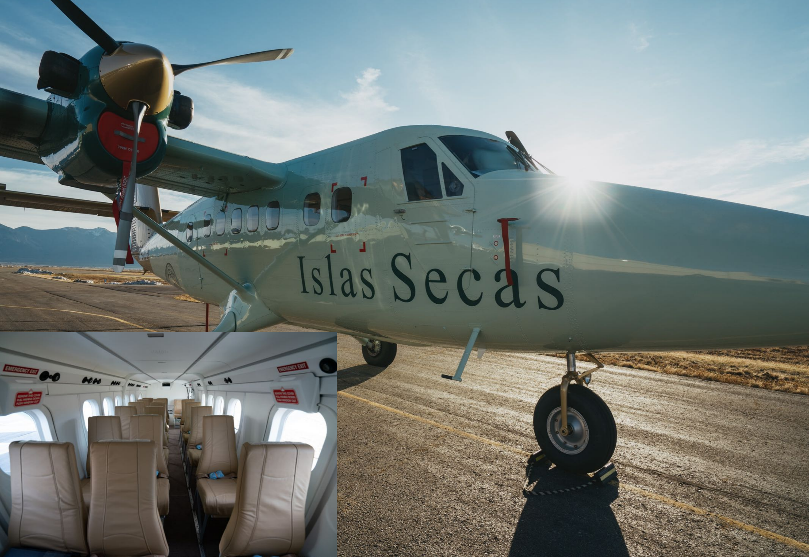
Islas Secas - Islas Secas Twin Otter private plane with 15 seats