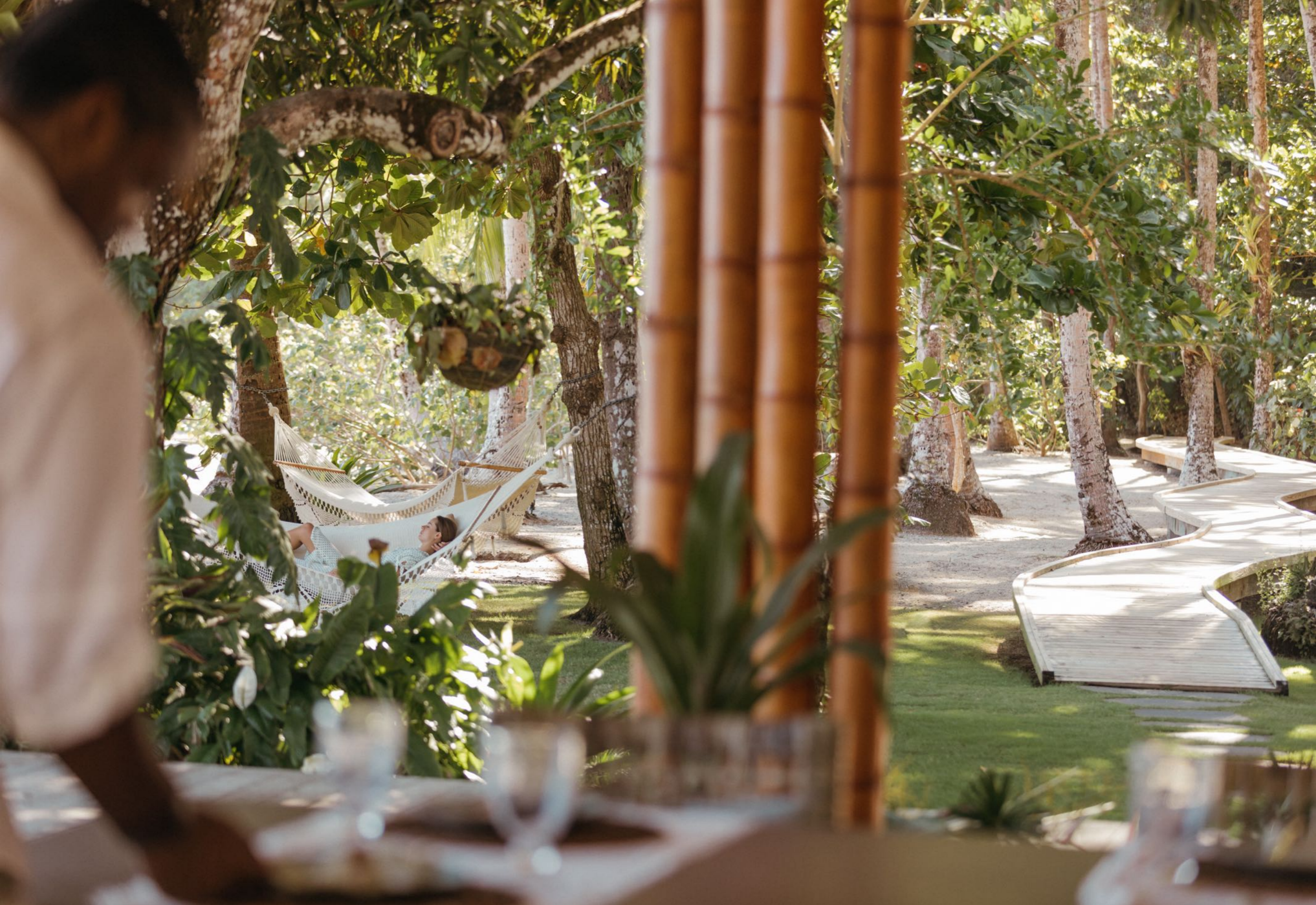
Islas Secas – Terraza garden