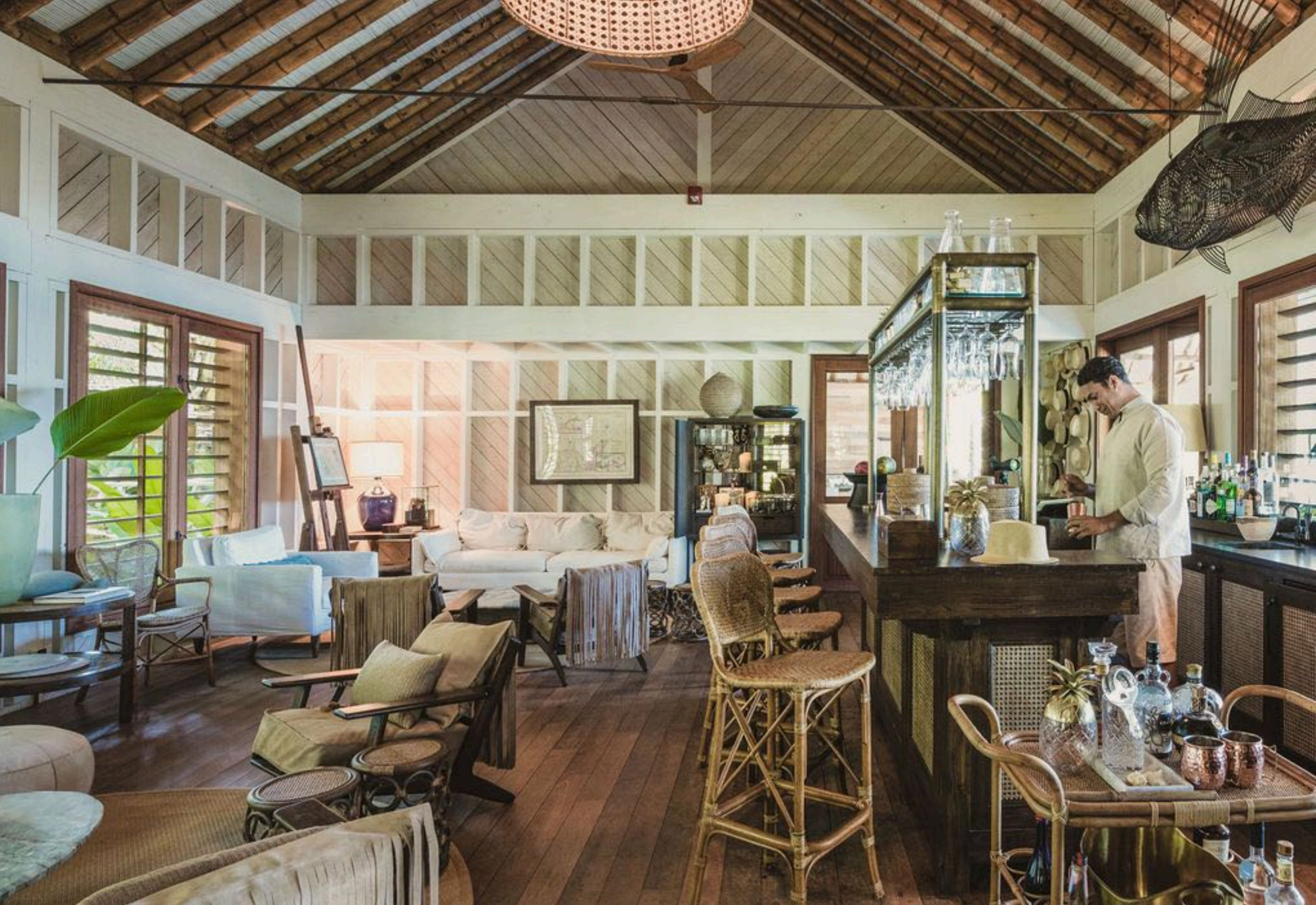
Islas Secas – Bar Lounge