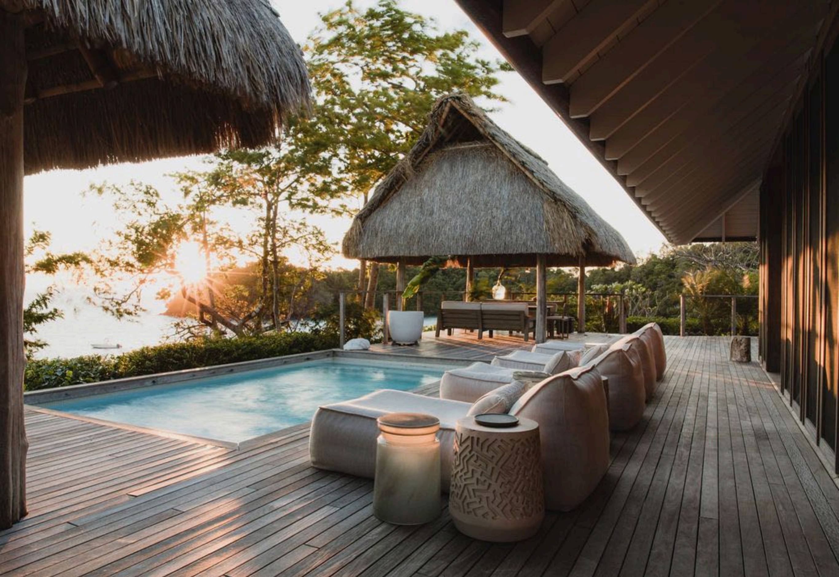
Islas Secas – Four-Bedroom Casita Grande pool