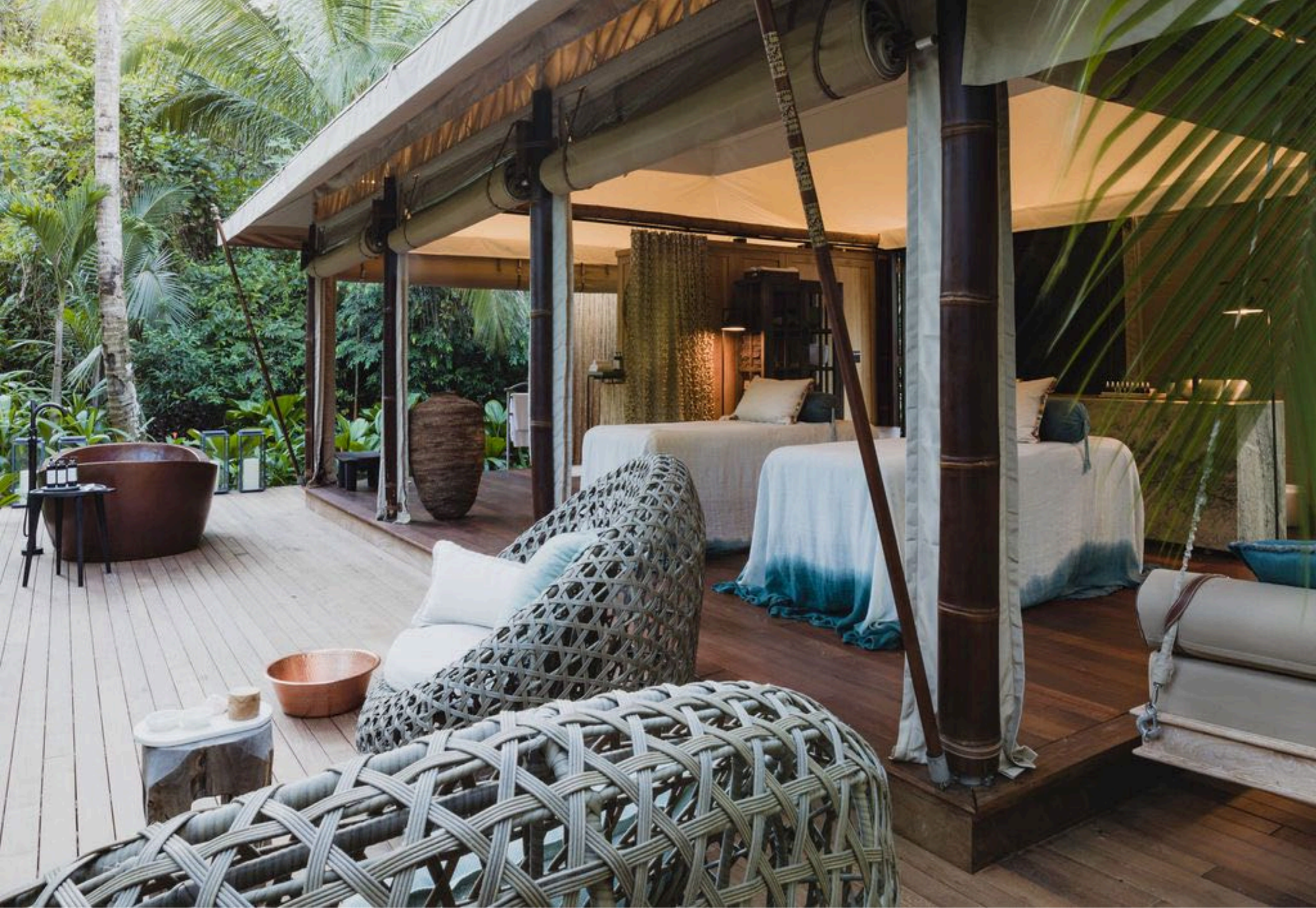
Islas Secas – The Jungle Spa