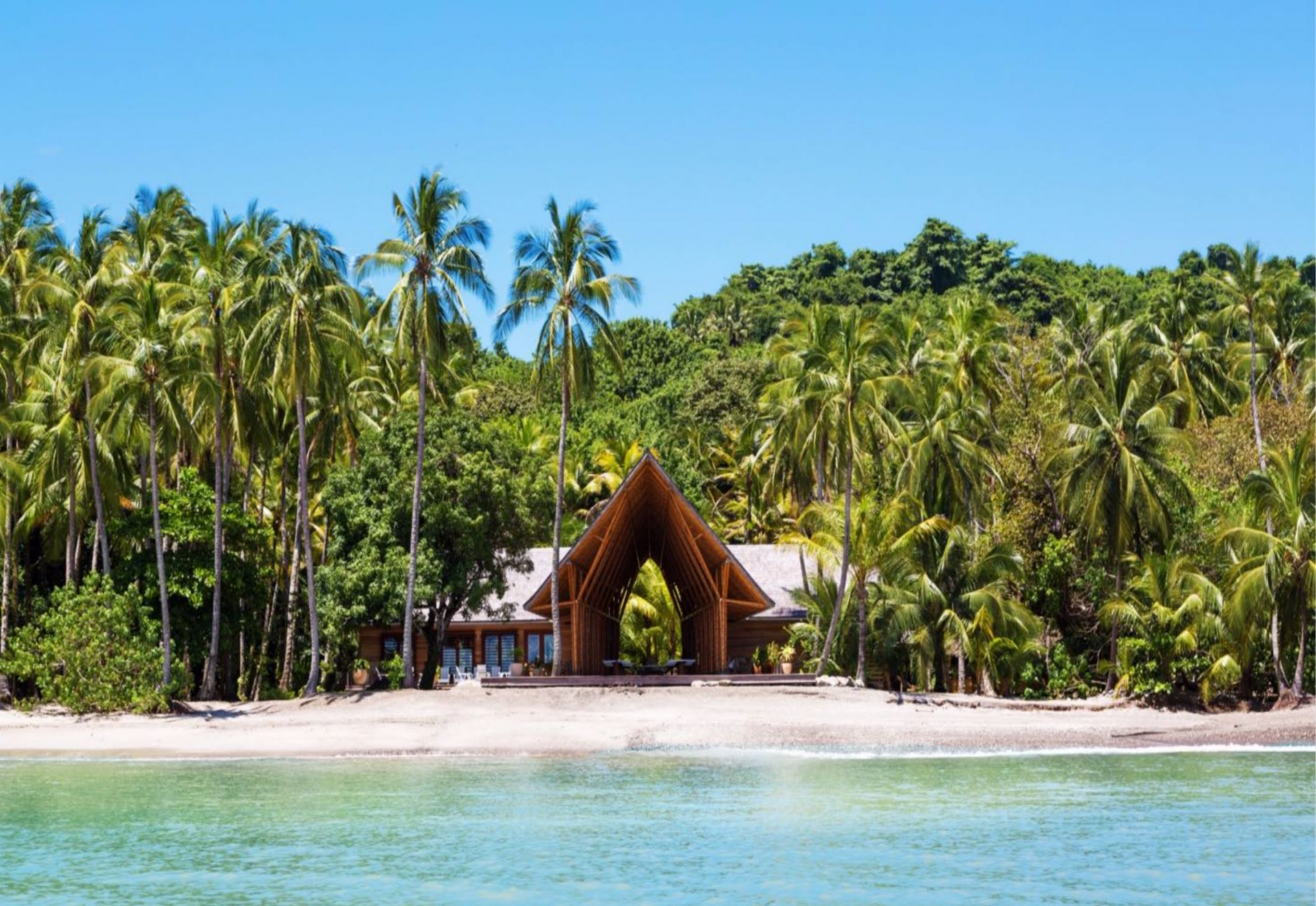
Islas Secas – Terraza Restaurant and Bar Lounge