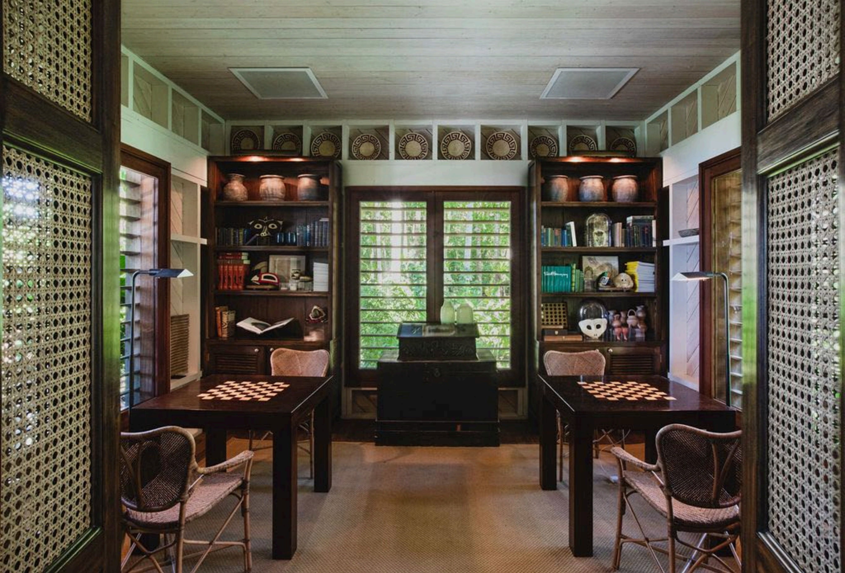
Islas Secas - Game Room