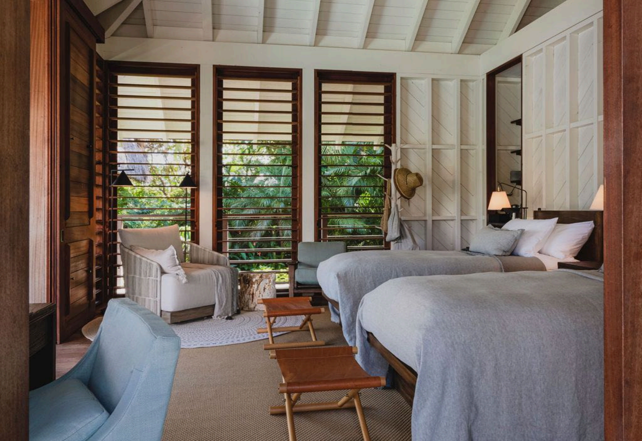
Islas Secas – Four-Bedroom Casita Grande Twin-Bedded Room