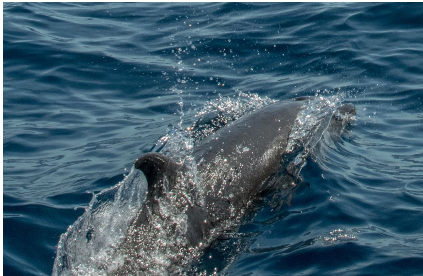
Islas Secas – Whale watching from July to October, one of the best fishing and diving spot in the world