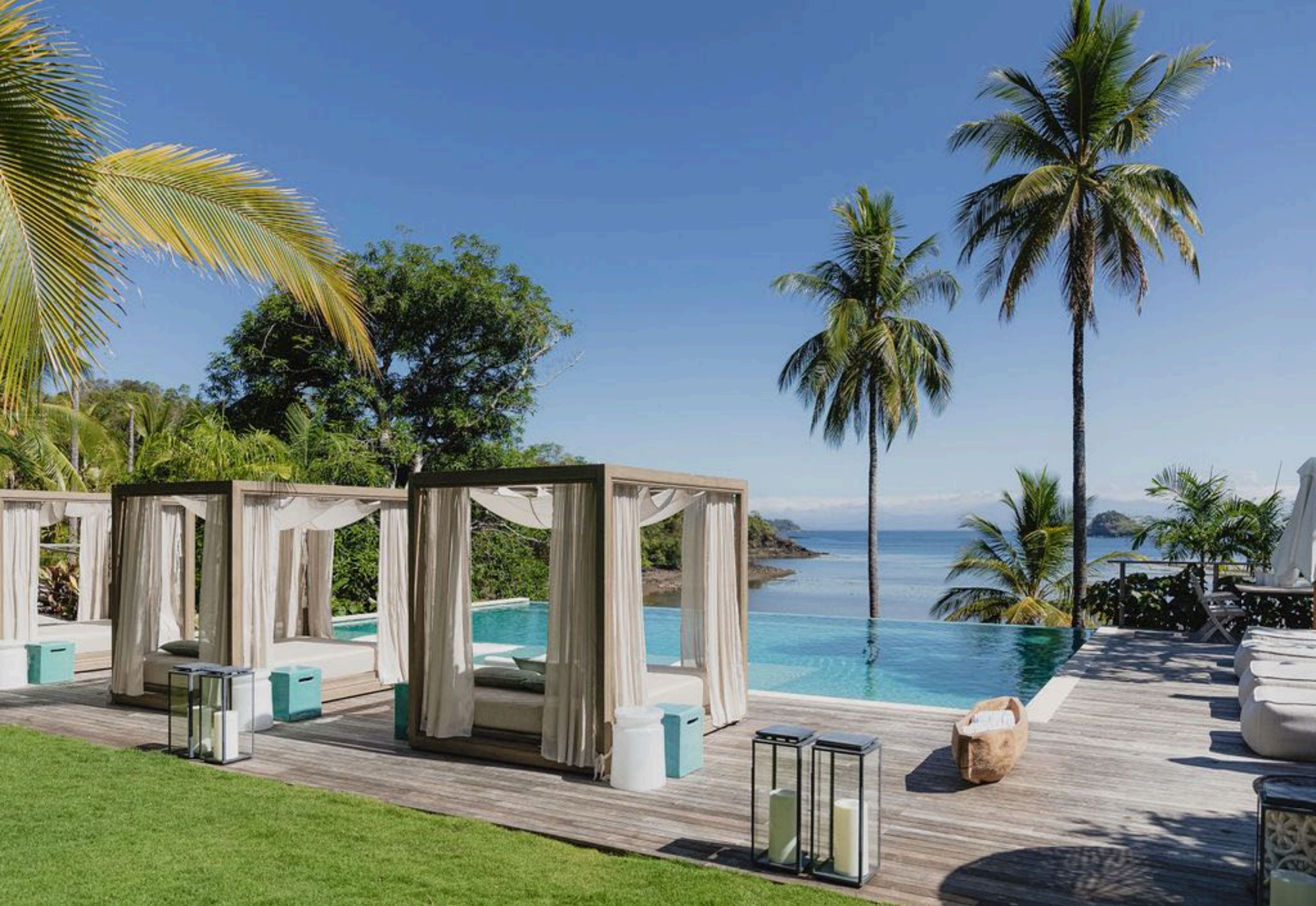
Islas Secas – Main Pool