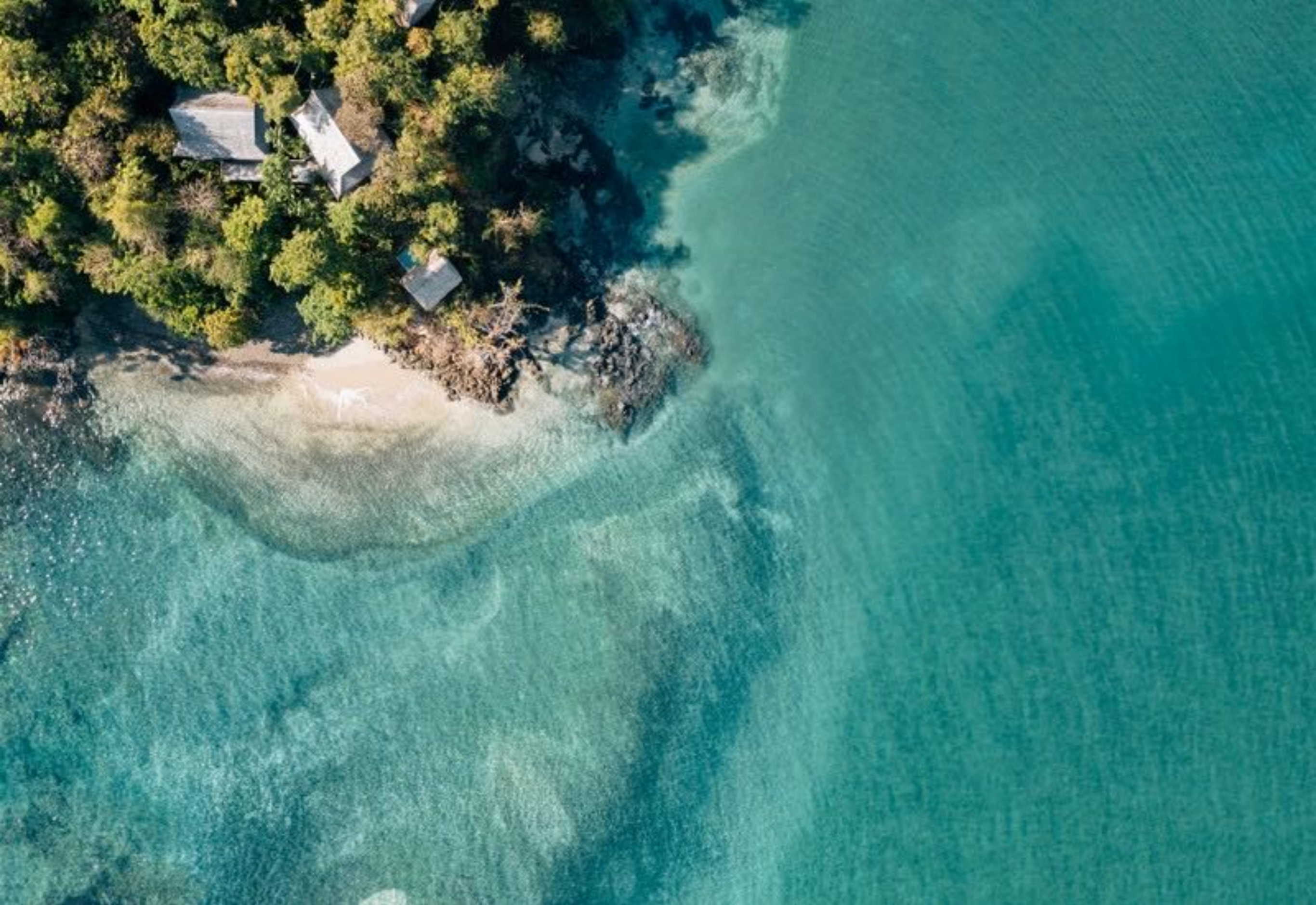
Islas Secas – Two-Bedroom Casita Sombras private beach