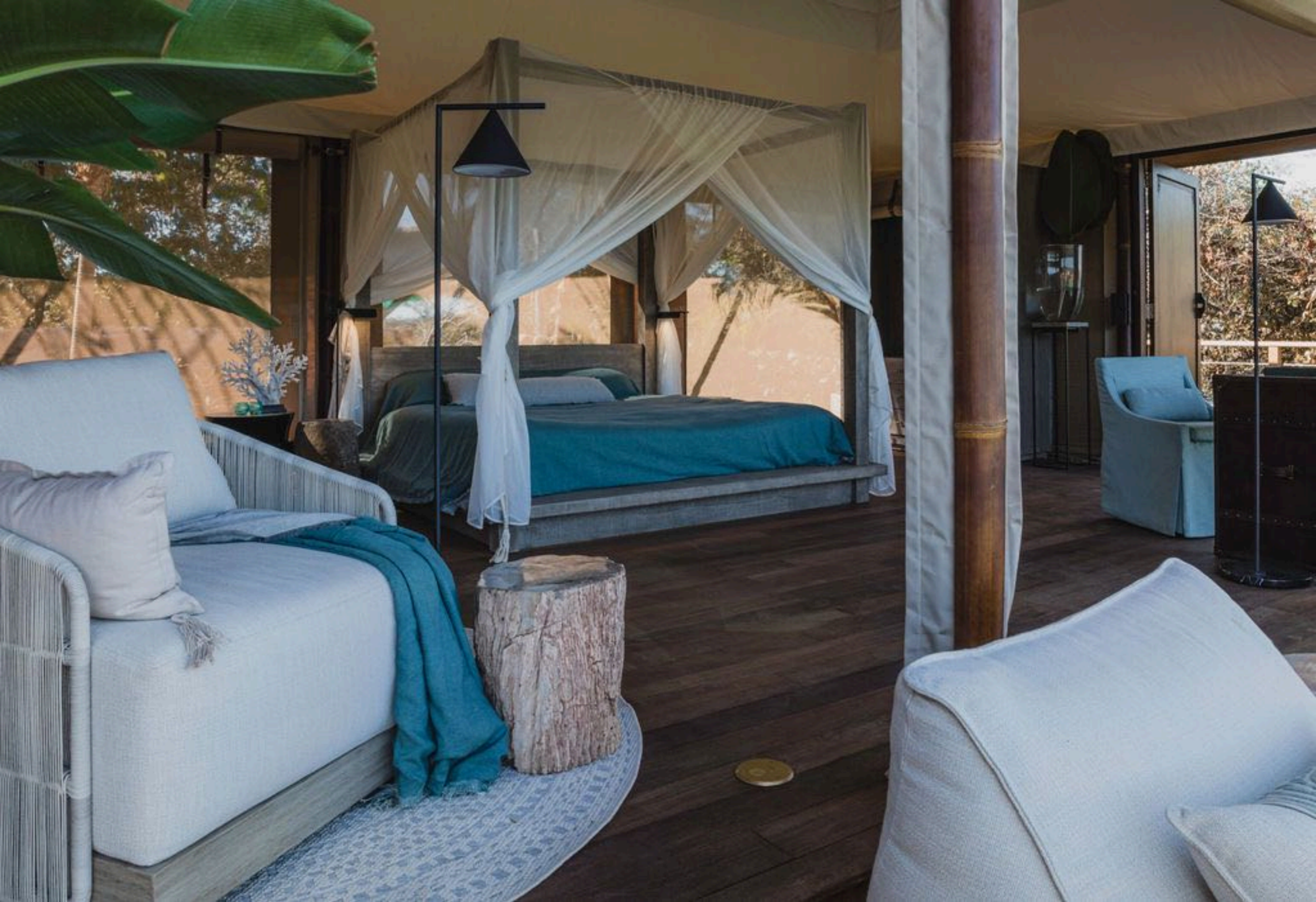
Islas Secas – One-Bedroom Tented Casita