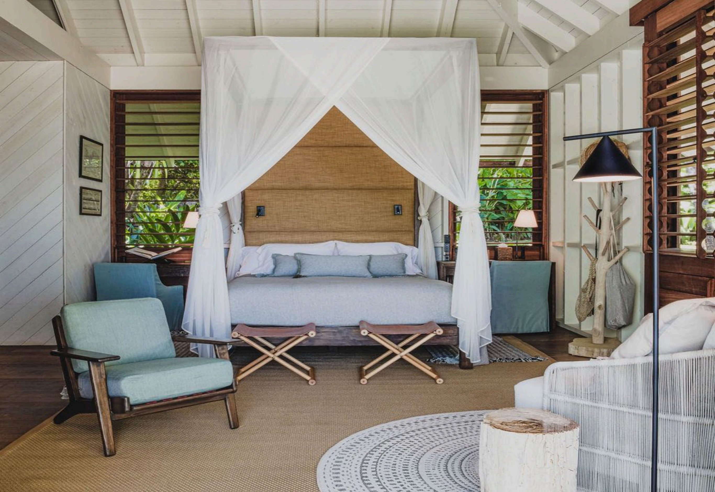
Islas Secas – One-Bedroom Casita Mirador