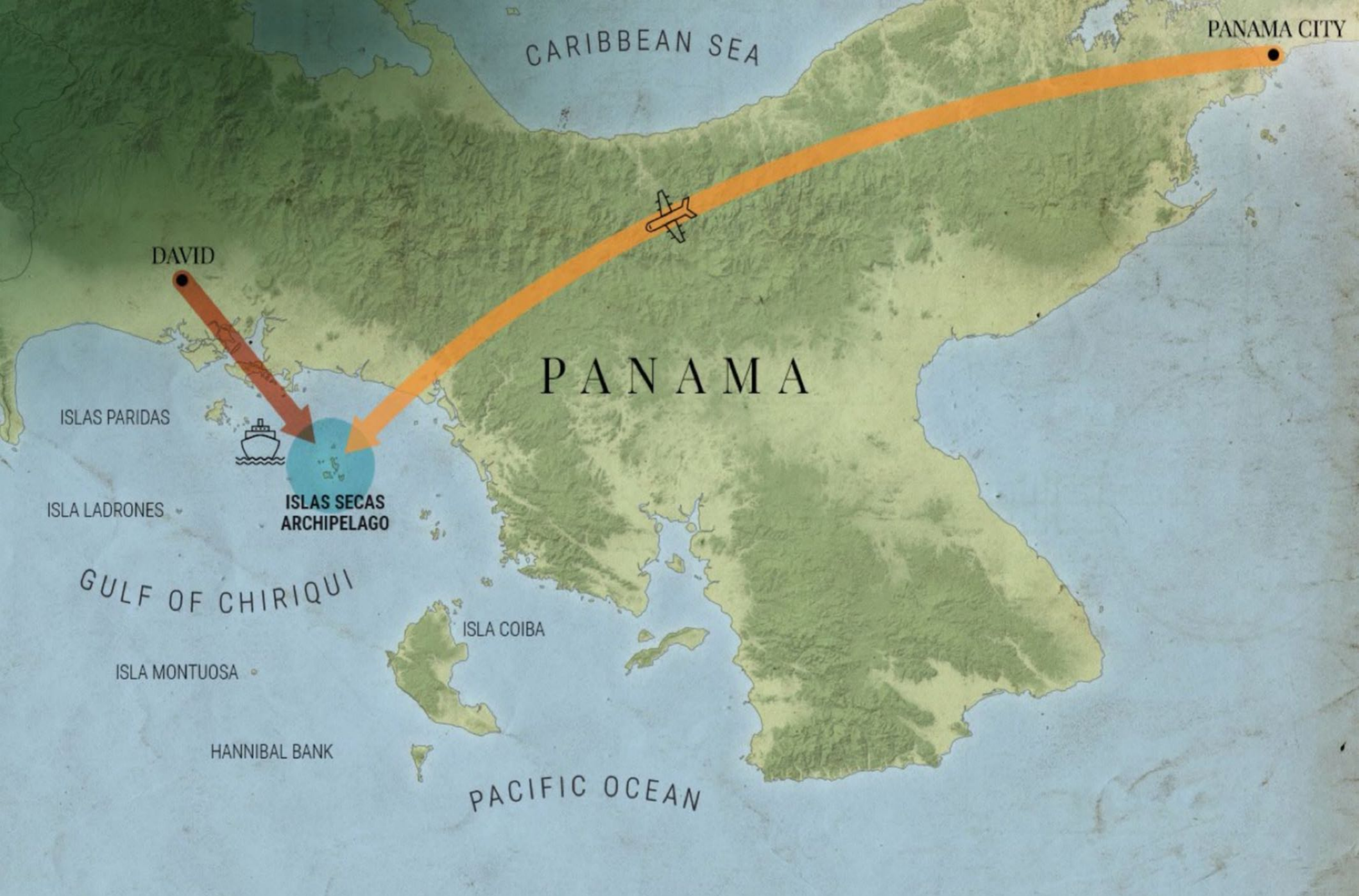
Islas Secas – Private Air Transfer flight to Islas Secas from Panama city International Airport (1h)