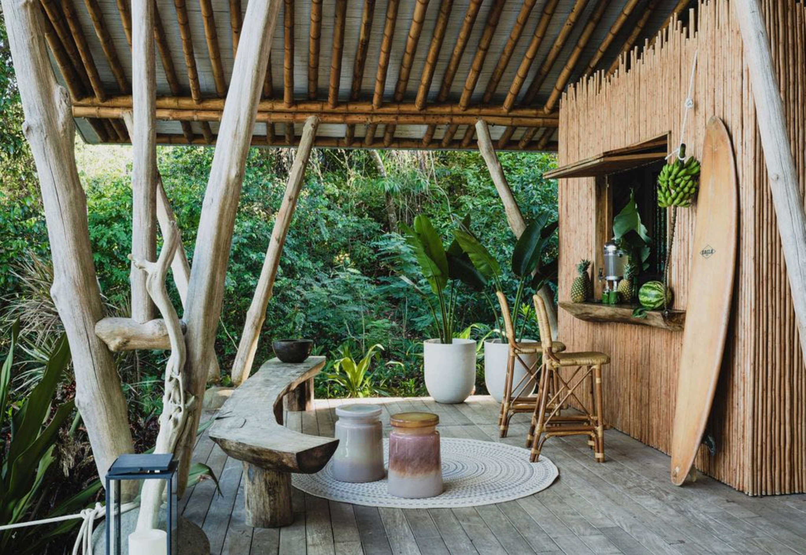
Islas Secas – Juice Bar at the Water Sport Center