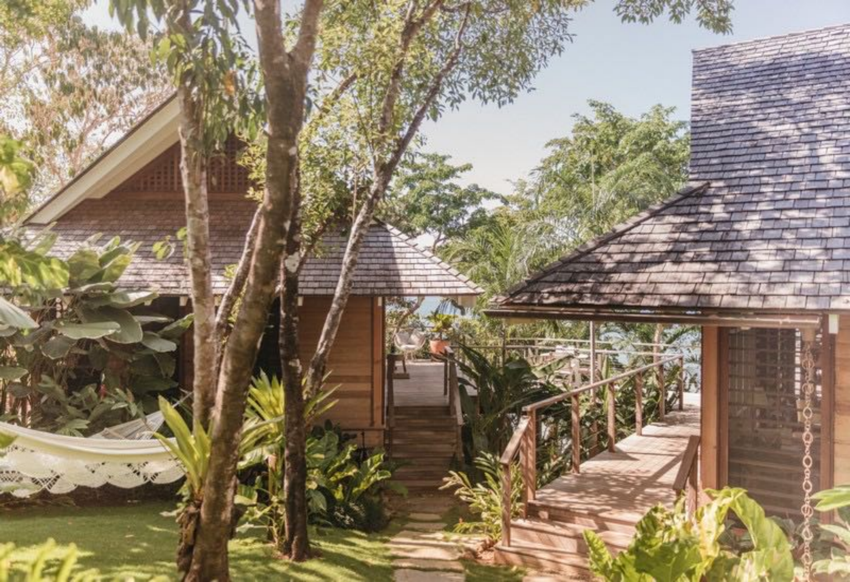
Islas Secas – Two-Bedroom Casita Sombras