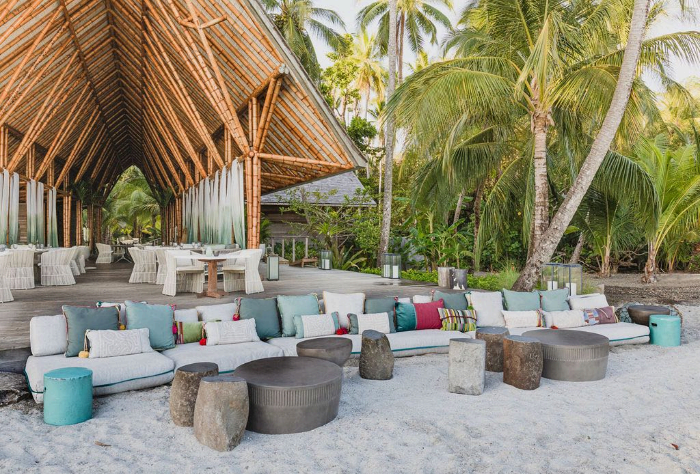
Islas Secas – Terraza Restaurant and Beach