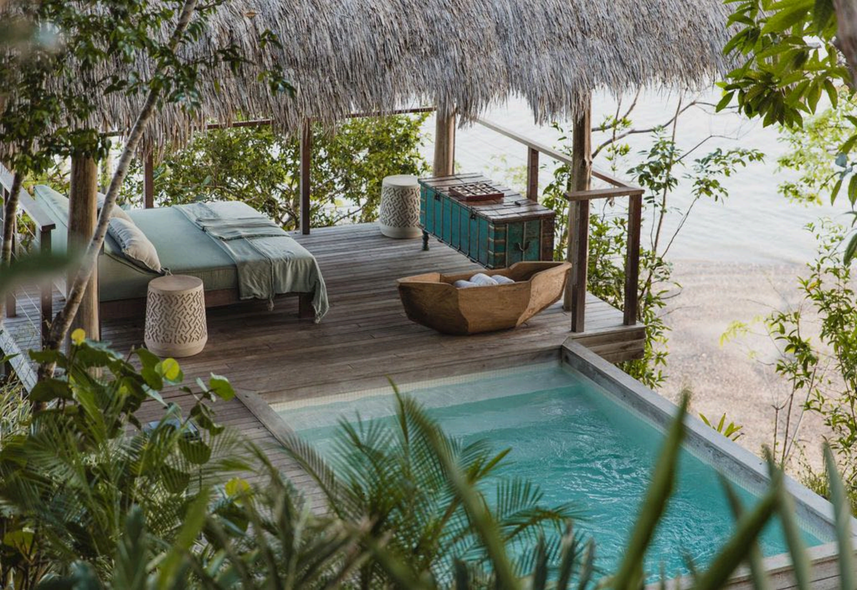
Islas Secas – Two-Bedroom Casita Sombras plunge pool