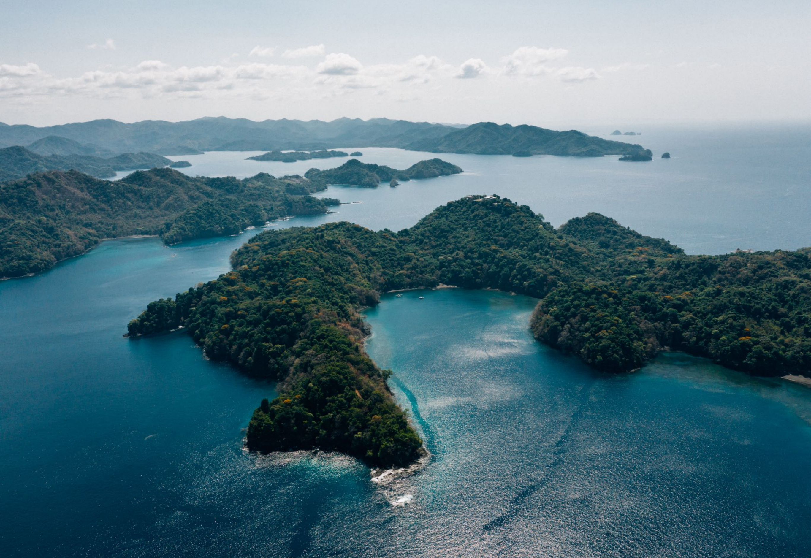
Islas Secas – 14 Private Islands with natural untouched jungle combining exceptional wildlife, wild fauna and flora