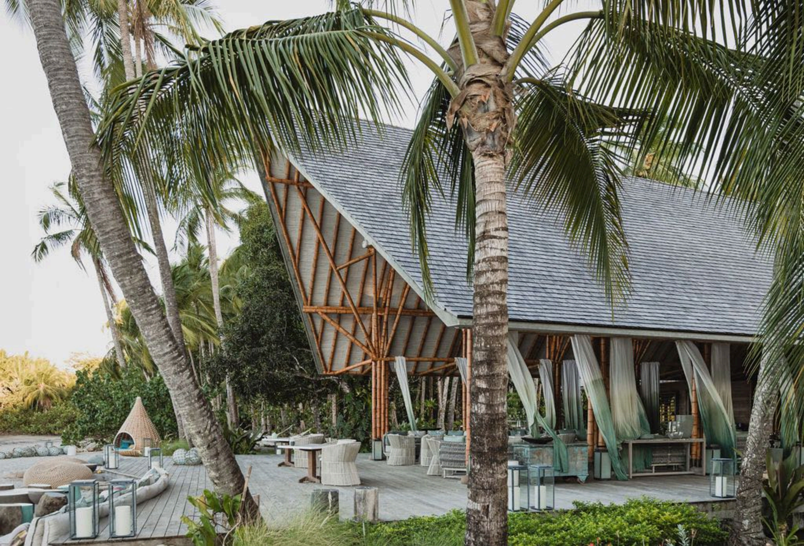
Islas Secas – Terraza Restaurant