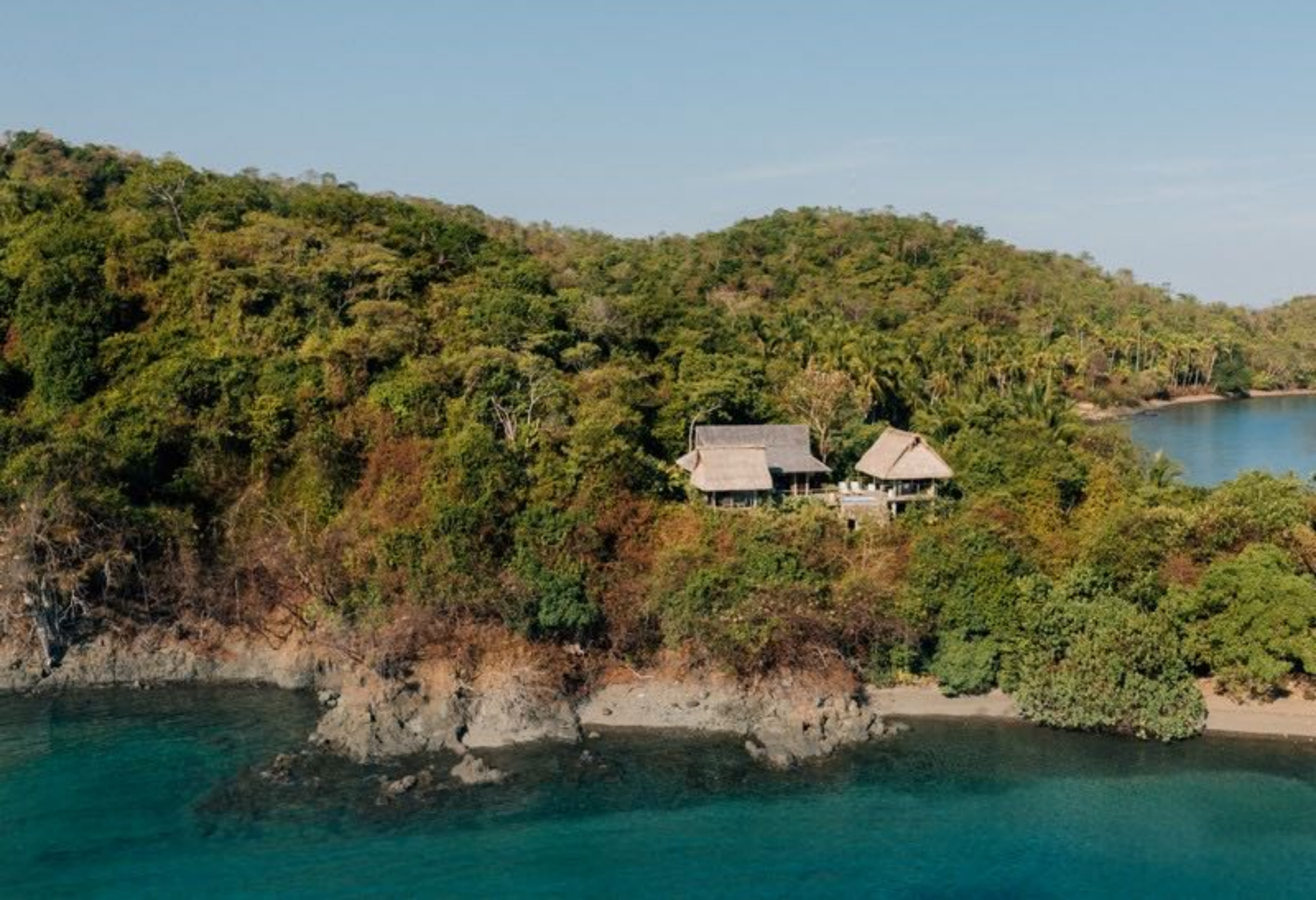
Islas Secas – One-Bedroom Casita Mirador