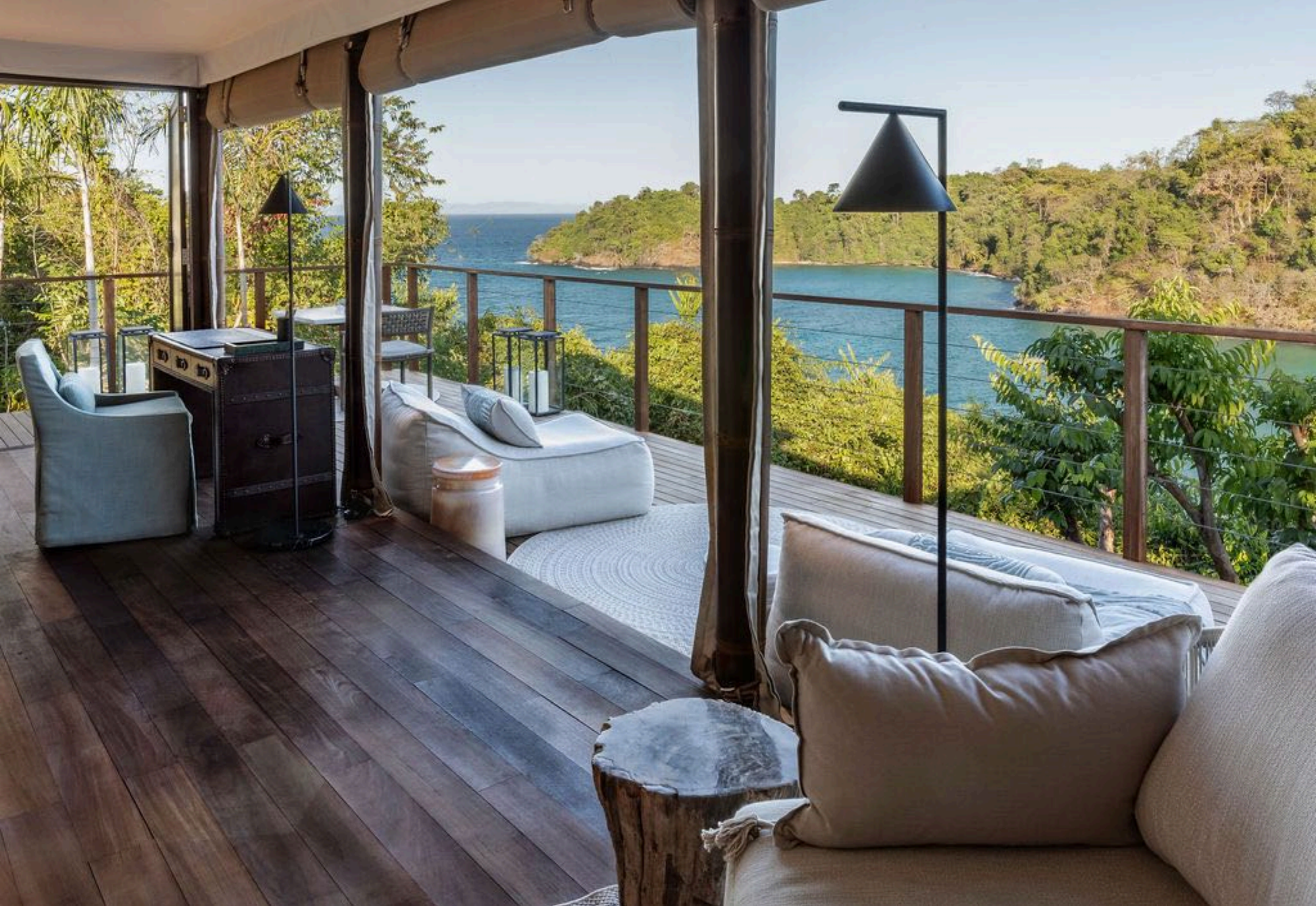
Islas Secas – One-Bedroom Tented Casita