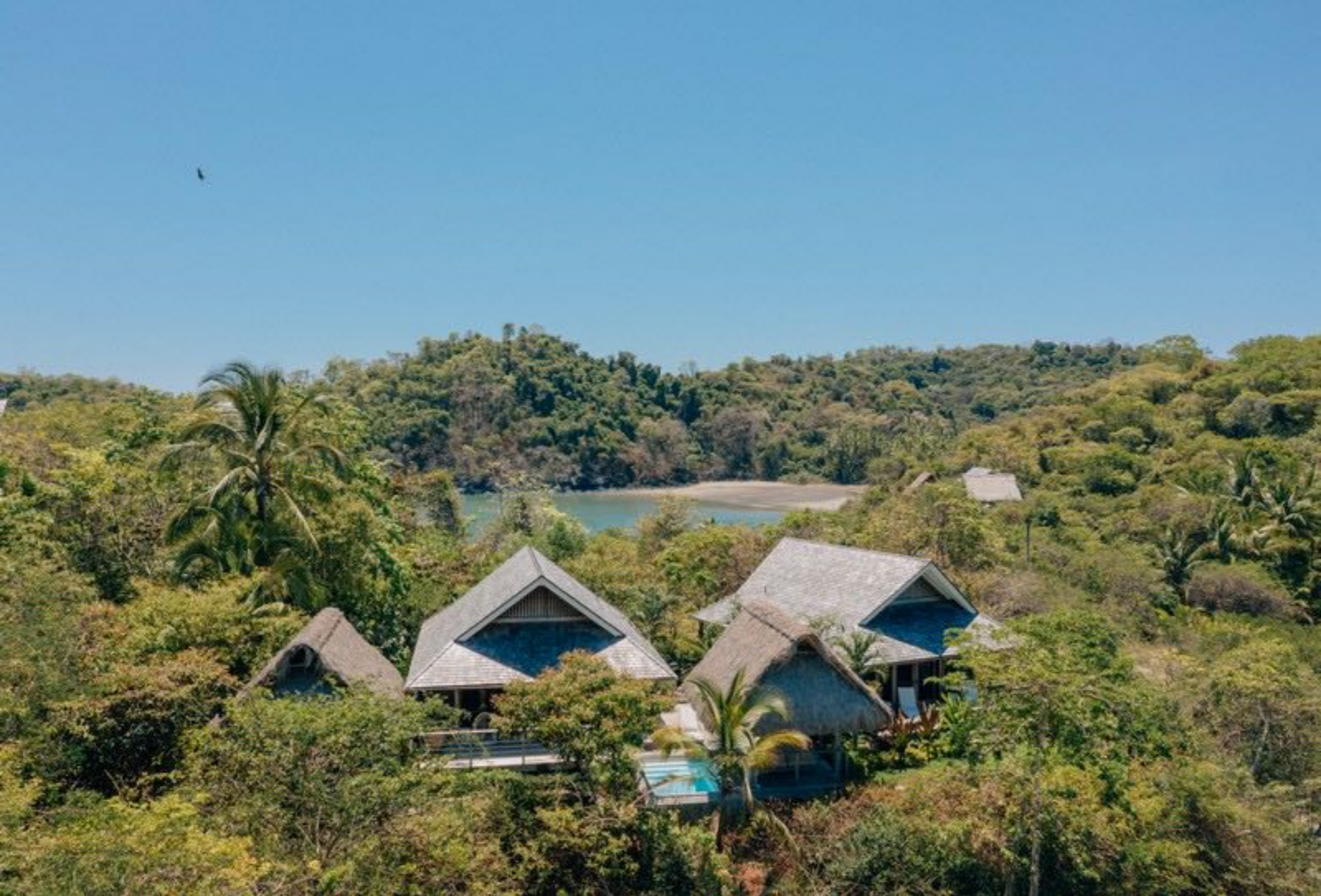
Islas Secas – Two-Bedroom Casita Tres Palmas