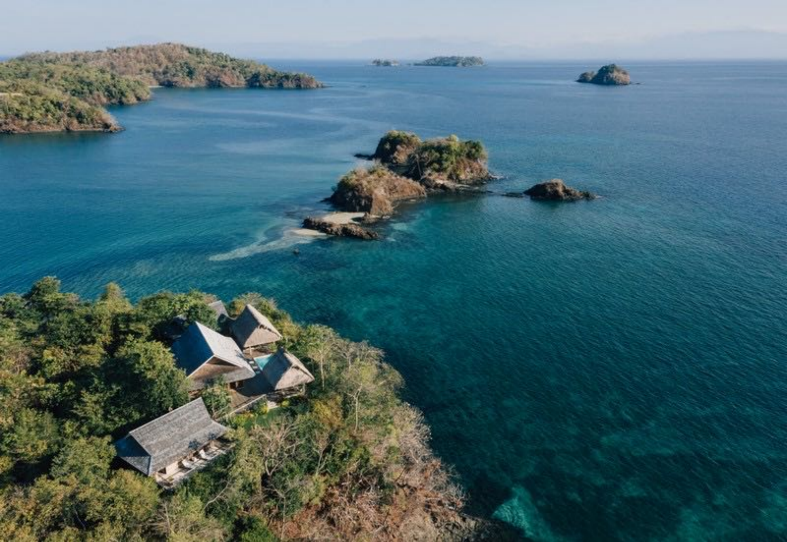
Islas Secas – Four-Bedroom Casita Grande